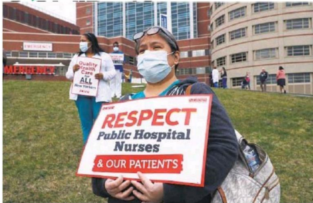
New York nurses seek more protective gear to safeguard themselves against a virus that has killed more than 500 in the city.